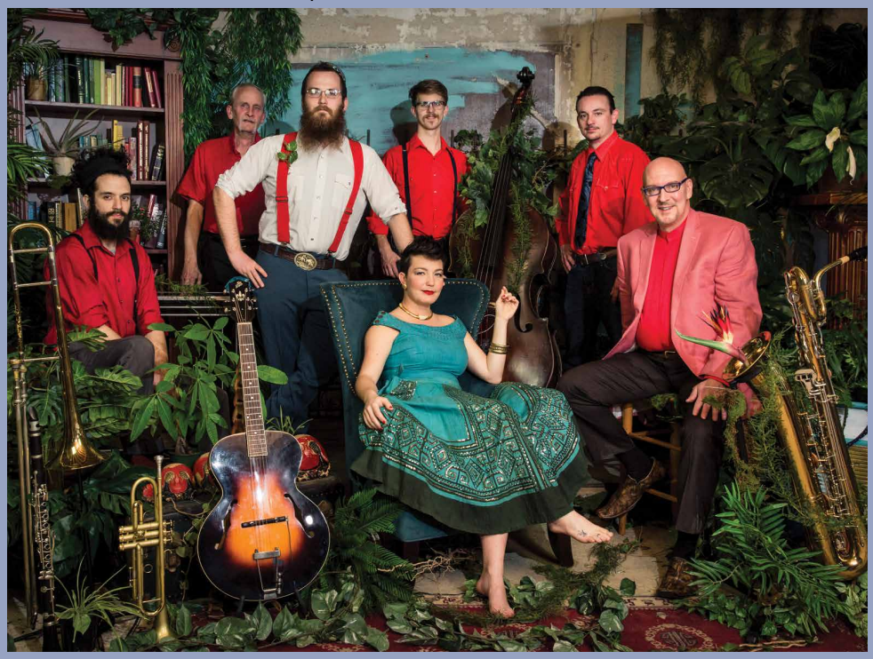
Concerts in the Court: The Bumper Jacksons