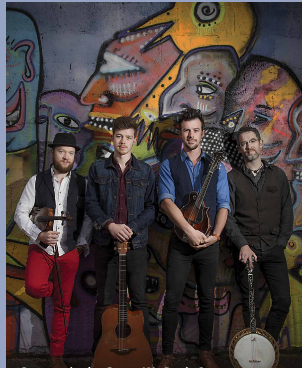
Concerts in the Court: We Banjo 3