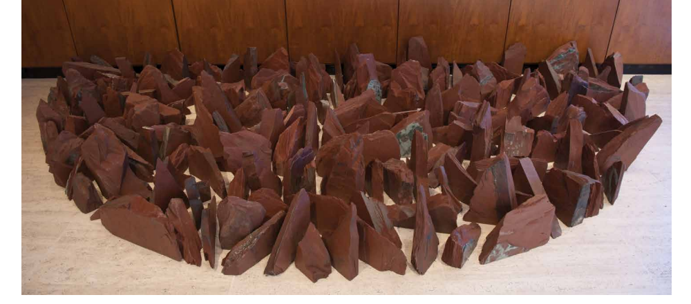
Richard Long (British, born 1945), Half Moon , 2015, Red slate quarried in Granville, New York, Museum Purchase, 2018.12

The Museum Education Department produced 486 dynamic programs that enhanced all of these exhibitions. The events were varied and included Art and Yoga, Art Alive Family Days, Art Story, lectures, workshops, artist demonstrations, film series, and food and wine pairings. A total of 14,237 visitors were educated and entertained as events explored art history and culture from numerous perspectives.