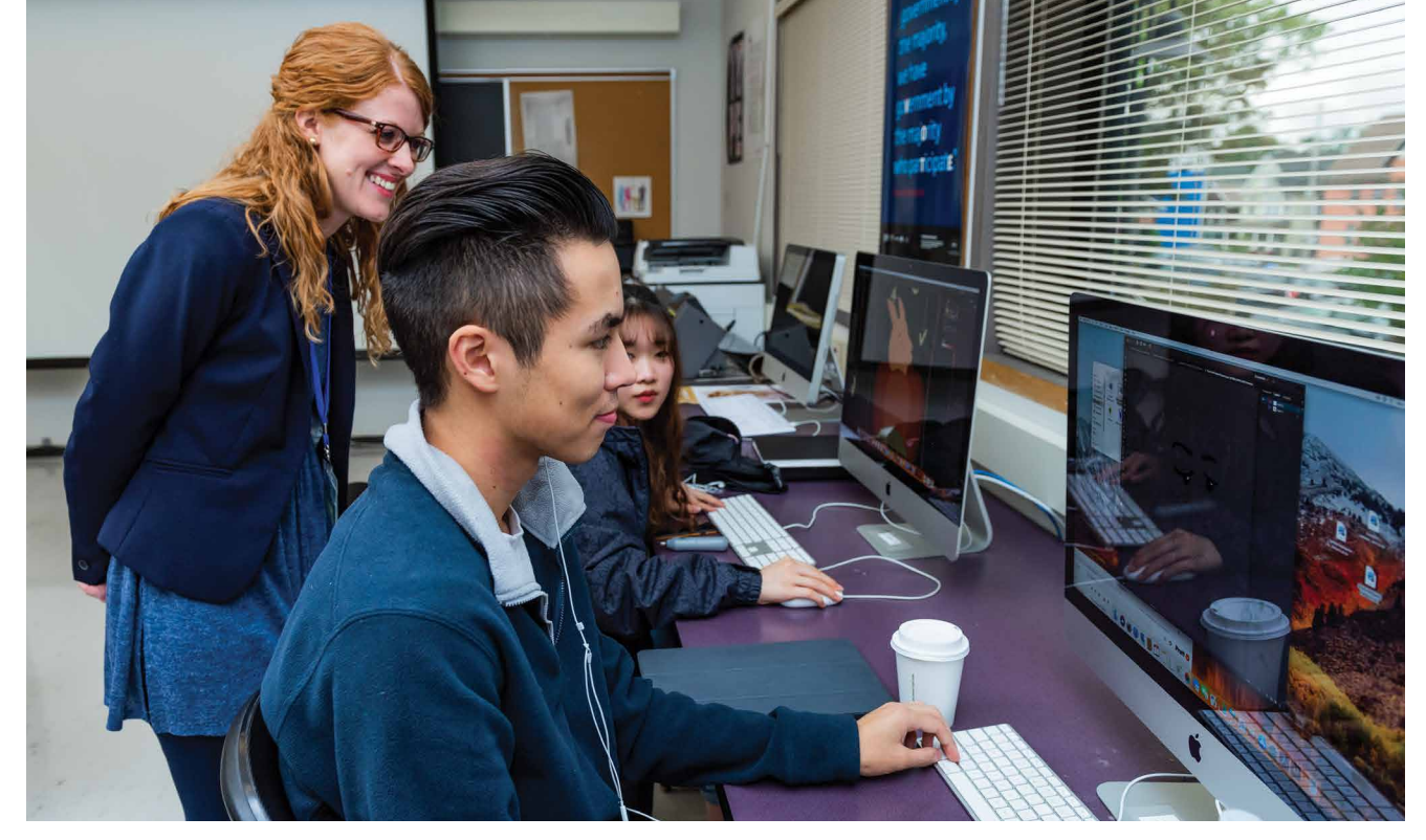
Communications Design class at PrattMWP College of Art and Design

integral components of the Institute's family, wonderfully fulfilling the goals and objectives of the AIR program. With a combination of lectures, credit and noncredit classes, Art Alive projects, and a closing exhibition of their work, they displayed effusive generosity of their time and talents. The work they completed on campus was recognized internationally as well.