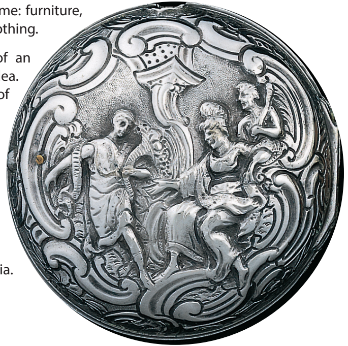
Pair-case Watch, Stoakes, 1750, silver, parcel-gilt, 66.7 x 50.8 x 30.5 mm, Proctor Collection, Frederick T. Proctor Watch Collection, PC. 222

Notice the figure in the center of this scene holding a cornucopia. The figure is an attendant of Ceres, the goddess of the harvest.