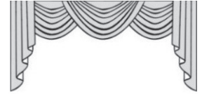
Drape or Swag