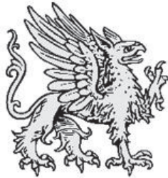
Griffin (part eagle, part lion)