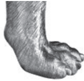
Animal hoof or paw